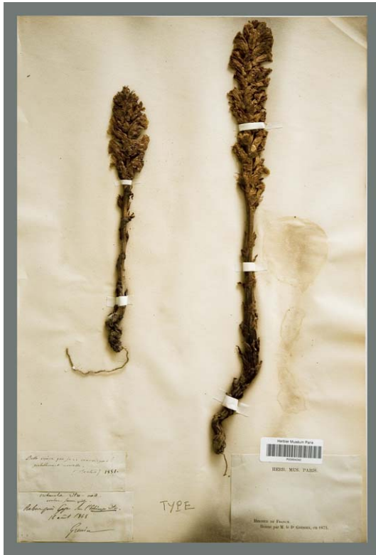
Fig. 1. Orobanche ritro . France, Rabou près Gap, sur l' Echinops ritro , 14 VIII 1848, Grenier (P). Lectotype.